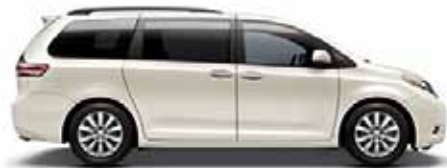
BLIZZARD PEARL 7, 8 Bisque or Light Gray interior