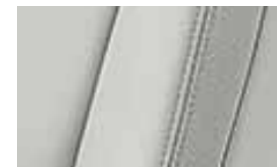
XLE textured leather in Light Gray