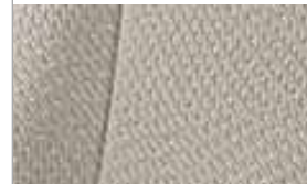
LE easy-clean fabric in Bisque