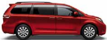
SALSA RED PEARL 6 Bisque or Light Gray interior