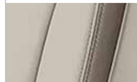
Limited two-tone leather in Bisque