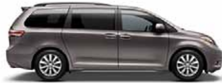
PREDAWN GRAY MICA Bisque, Light Gray or Dark Charcoal 5 interior