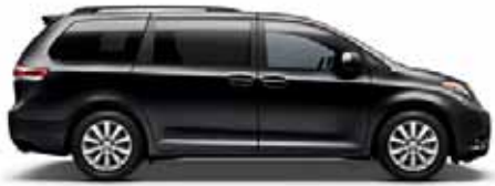
BLACK Bisque, Light Gray or Dark Charcoal 5 interior