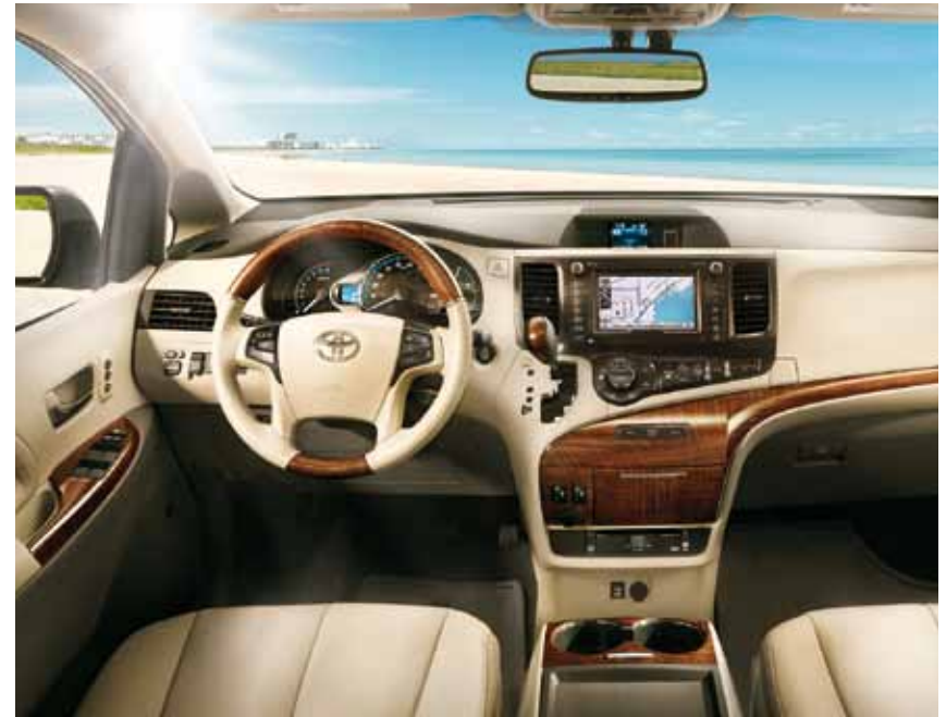
Limited interior shown in Bisque with available Premium Package, Convenience Package and Advanced Technology Package.

Along with its more spacious interior, powerful yet efficient engines and enough technology to impress a rocket scientist, the all-new Sienna offers something most minivans don't: a responsive driving feel wrapped in a sleek shape. The 2011 Toyota Sienna. Moving Forward.