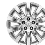
LE AWD, XLE AWD and Limited 18-in. 10-spoke machine-finished alloy wheel