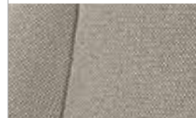
Sienna fabric in Bisque