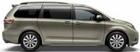
CYPRESS PEARL 6 Bisque or Light Gray interior