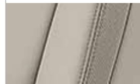
XLE textured leather in Bisque