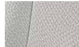
LE easy-clean fabric in Light Gray