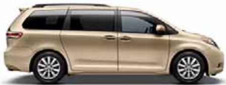
SANDY BEACH METALLIC 6 Bisque interior