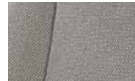
Sienna fabric in Light Gray