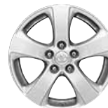
Sienna and LE 17-in. 5-spoke alloy wheel