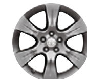
SE 19-in. 6-spoke super chrome-finished alloy wheel