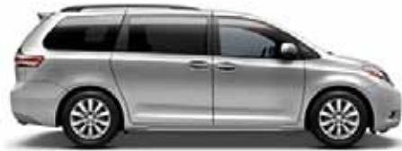
SILVER SKY METALLIC Bisque, Light Gray or Dark Charcoal 5 interior