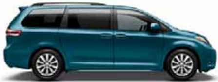
SOUTH PACIFIC PEARL Bisque, Light Gray or Dark Charcoal 5 interior