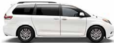
SUPER WHITE 9 Bisque, Light Gray or Dark Charcoal 5 interior