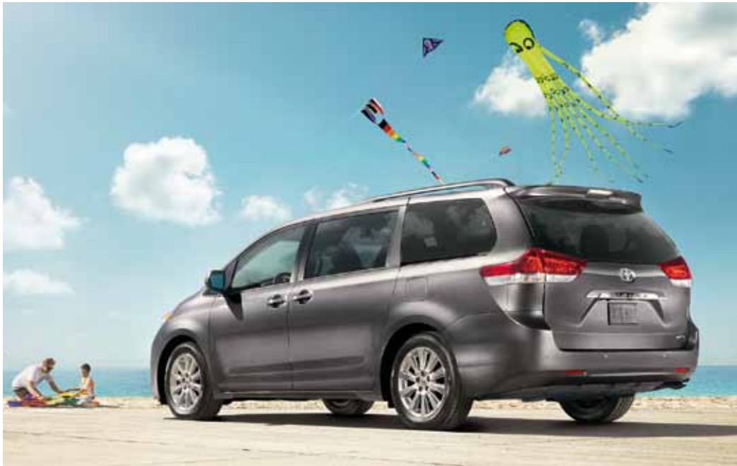
Limited shown in Predawn Gray Mica.