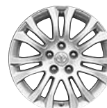
XLE 17-in. 7-spoke machine-finished alloy wheel

See numbered footnotes in Disclaimers section.