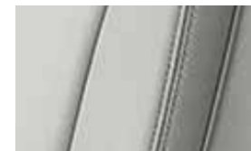
Limited two-tone leather in Light Gray