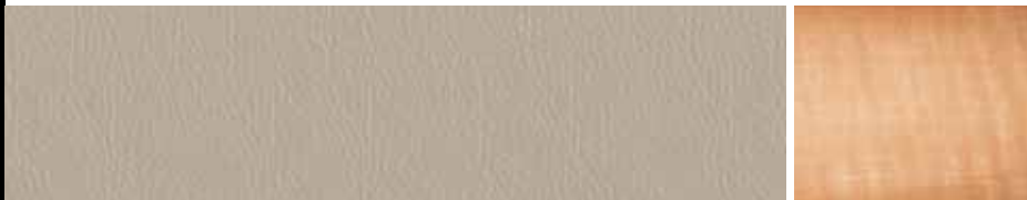
CAMEL LEATHER | FIGURED MAPLE WOOD

Camel Leather trim is offered with: Dark Blue Pearl, Tuxedo Black, Royal Red, White Platinum Tri-Coat