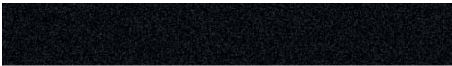
TUXEDO BLACK METALLIC