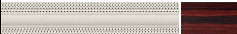
CASHMERE-COLORED LEATHER TRIM WITH TUXEDO STRIPE | FINE LINE EBONY WOOD