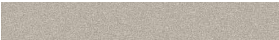
GOLD LEAF METALLIC