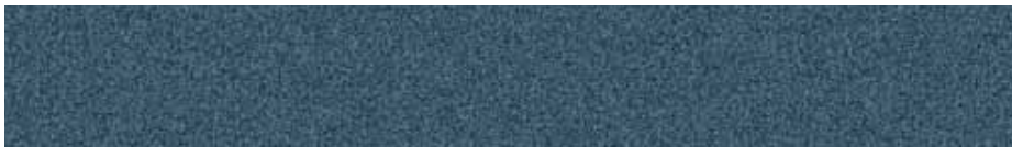
STEEL BLUE METALLIC