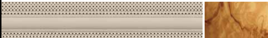
LIGHT CAMEL LEATHER TRIM WITH TUXEDO STRIPE | OLIVE ASH WOOD