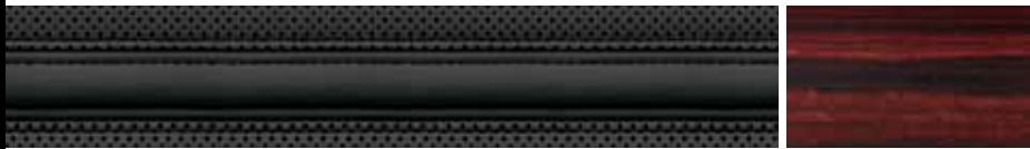
CHARCOAL BLACK LEATHER TRIM WITH TUXEDO STRIPE | FINE LINE EBONY WOOD